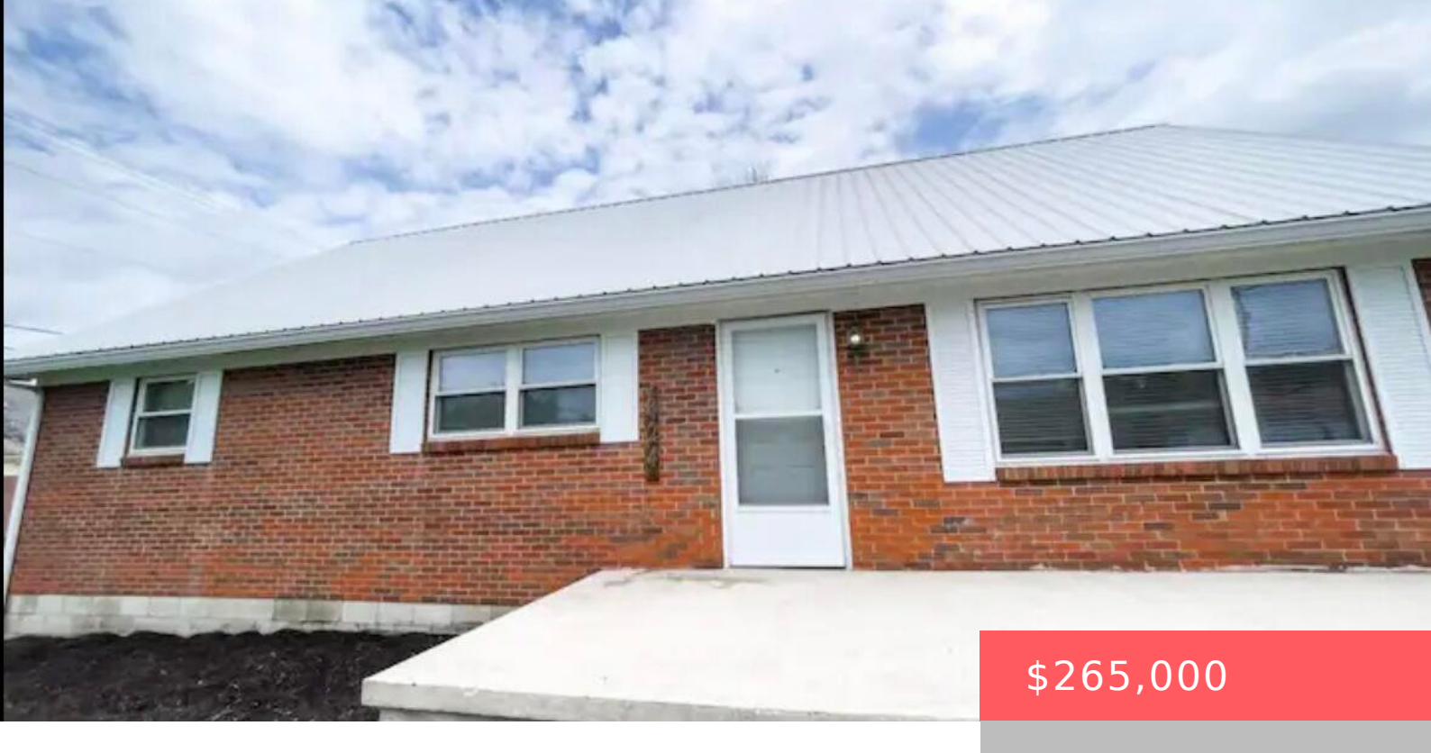
STANTON, KY, 40380